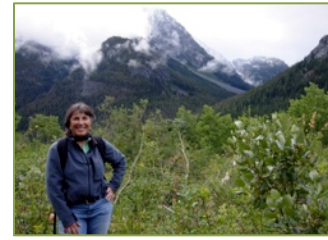
Glacier Peak Wilderness near Holden Village

Sponsored by: Holden Village and the Valparaiso Project NATURE JOURNALING SESSIONS